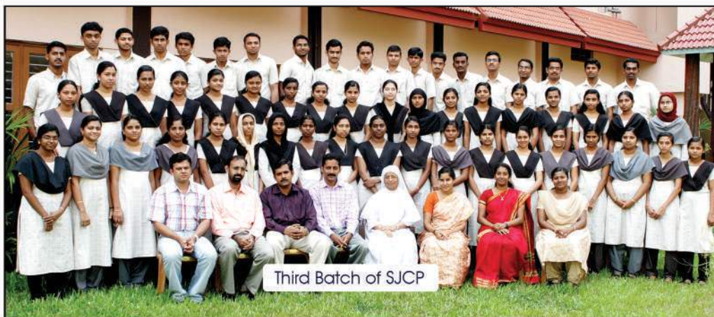
Third Batch of SJCP