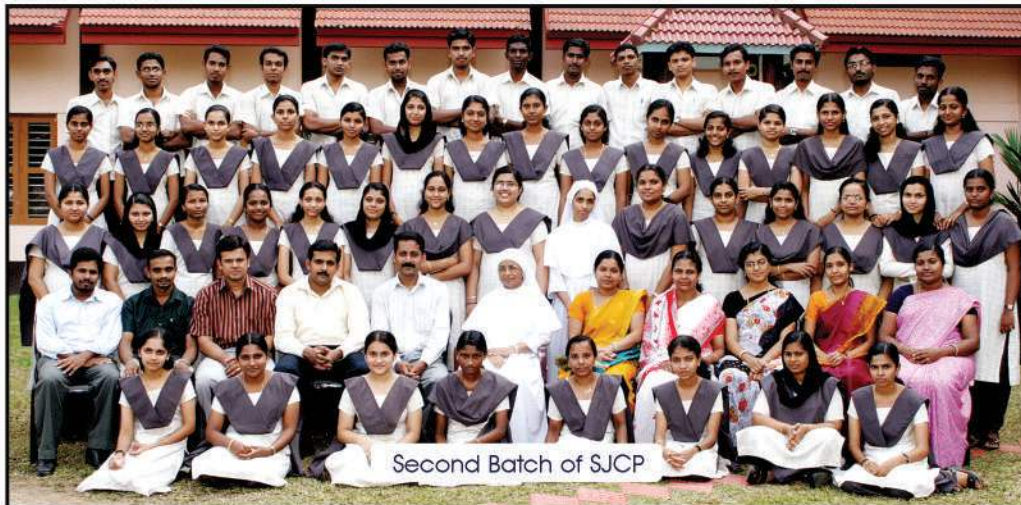
Second Batch of SJCP