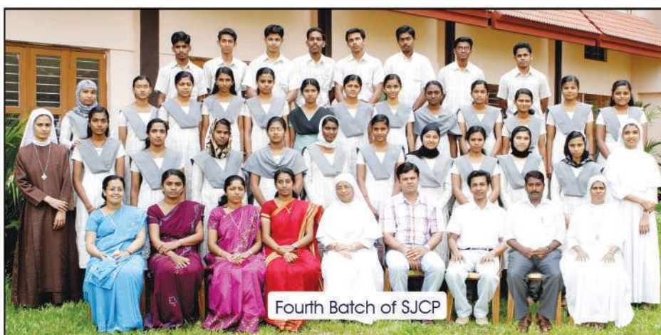
Fourth Batch of SJCP