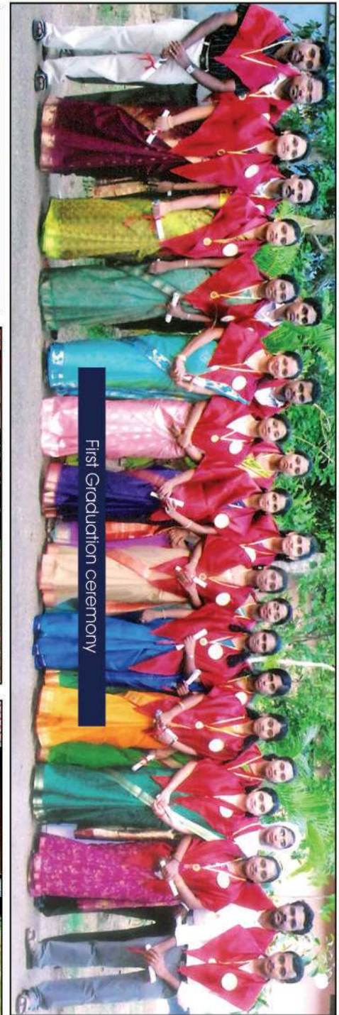
First Graduation ceremony