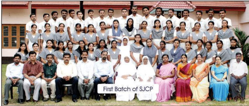
First Batch of SJCP