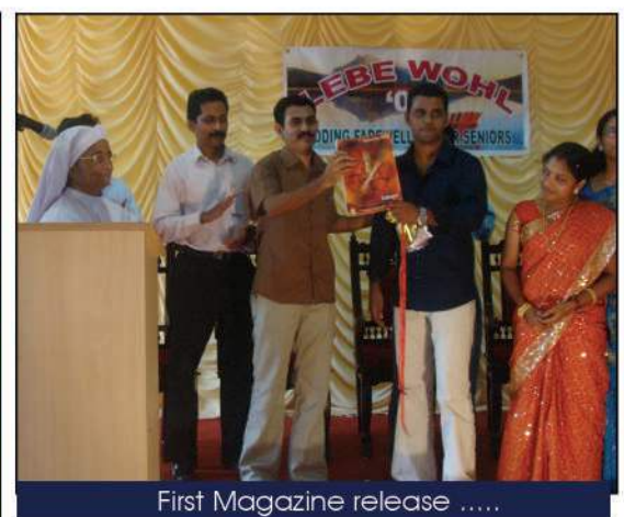
First Magazine release .....