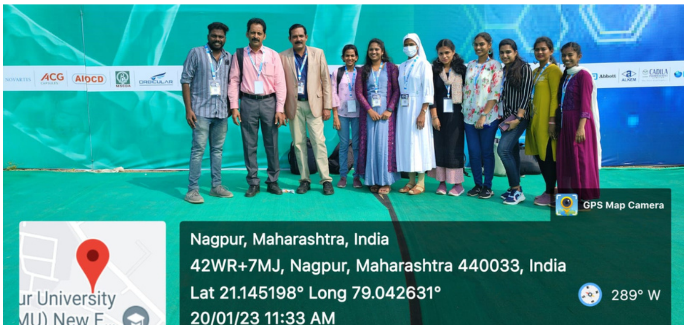
Delegates from St. Joseph's College of Pharmacy attending IPC, Nagpur-2024