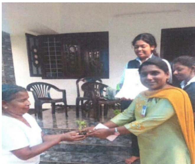
Distribution of plant saplings

The National Service Scheme (NSS) of the College started a commendable initiative aimed at environmental conservation by distributing saplings to the surrounding areas of the institution. Through the collective efforts of NSS volunteers and members of the community, numerous saplings were planted in June-July /2023 , contributing to the preservation of green spaces and the enhancement of ecological balance in the vicinity.