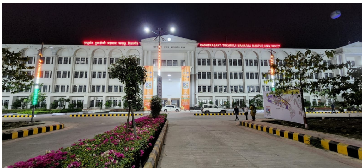
Rashtrasant Tukadoji Maharaj Nagpur University, Nagpur