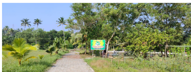
Sanjoe Meadows- the nature club initiative of St. Joseph's College of Pharmacy