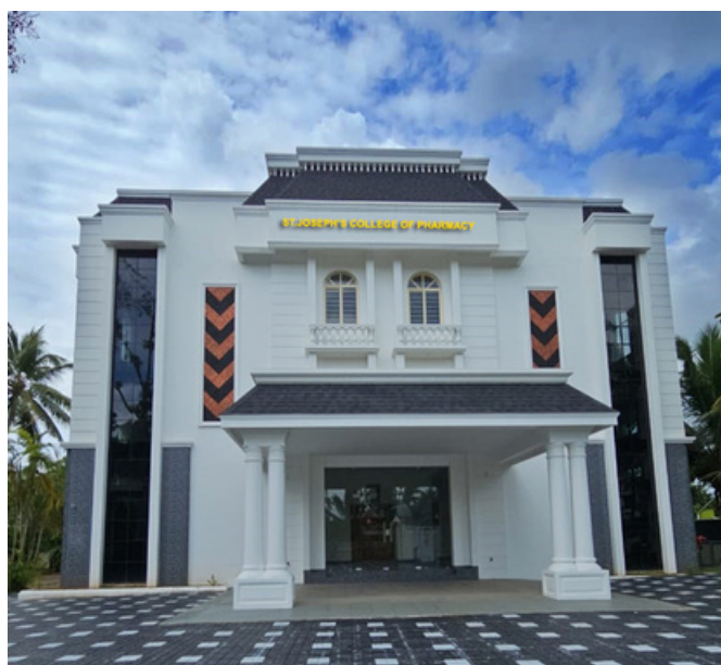
The new Admin. Block (E) of the College which is entirely powered by solar energy