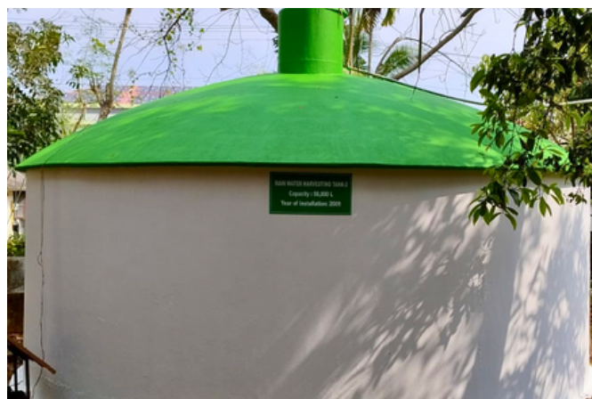
Rain Water Harvesting

There is a rainwater gathering system on campus. Rainwater gathered in open spaces with a high run-off coefficient and from the building's roof. The rainwater collected was moved to a percolation tank on the college campus, which was placed in a practical location. Since 2005, the campus is practising a rainwater harvesting system. The property has five 5000L tanks located throughout. Plumbing is distributed to the rainwater tank through pipes that are connected to the roof.