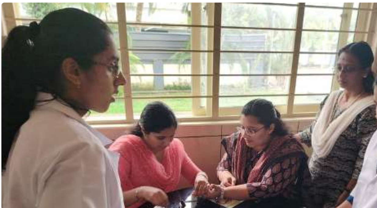
Blood sugar monitoring on World Diabetes Day