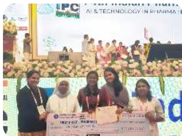
A cheerful Team St. Joseph's at the IPC-2025 venue in Bengaluru