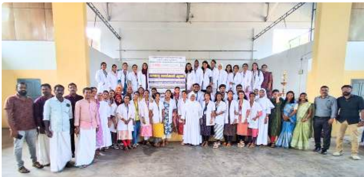
Medical Camp Team

A free medical camp was successfully organised under the joint initiative of St. Joseph's College of Pharmacy, Thycattussery St. Antony's Church Parish and CLC, Lourdes Hospital, Ernakulam and The Eye Foundation Super Speciality Hospital, Cherthala with the active support of the National Service Scheme (NSS) unit. The camp was conducted at the Thycattussery St. Antony's Church Parish Hall, Cherthala, on 6th December 2025, from 9.30 AM to 1.00 PM, with the objective of providing accessible healthcare services to the local community.