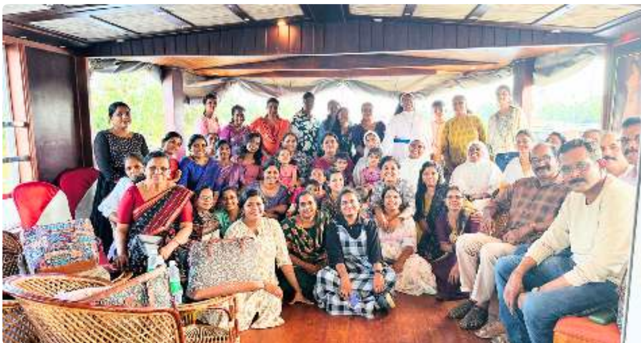
Houseboat Cruise by Staff at Vembanad Lake on 27 September 2025

A one-day staff tour was thoughtfully organised by St. Joseph's College of Pharmacy, Cherthala with the objective of promoting relaxation, team bonding, and interpersonal harmony among staff members. For this purpose, a houseboat was hired for an exclusive day-long cruise through the scenic backwaters of Vembanad Lake, offering a refreshing break from routine academic and administrative responsibilities. The tranquil journey across the lake provided an ideal setting for informal interaction and rejuvenation amidst nature. A well-arranged lunch was served on board, followed by evening tea and snacks, which added to the comfort and enjoyment of the participants. All staff members, including both teaching and non-teaching personnel, actively took part in the tour, reflecting a strong sense of unity and inclusiveness within the institution. The program created opportunities for strengthening professional relationships, enhancing mutual understanding, and fostering a positive work culture. Overall, the staff tour was a memorable one.