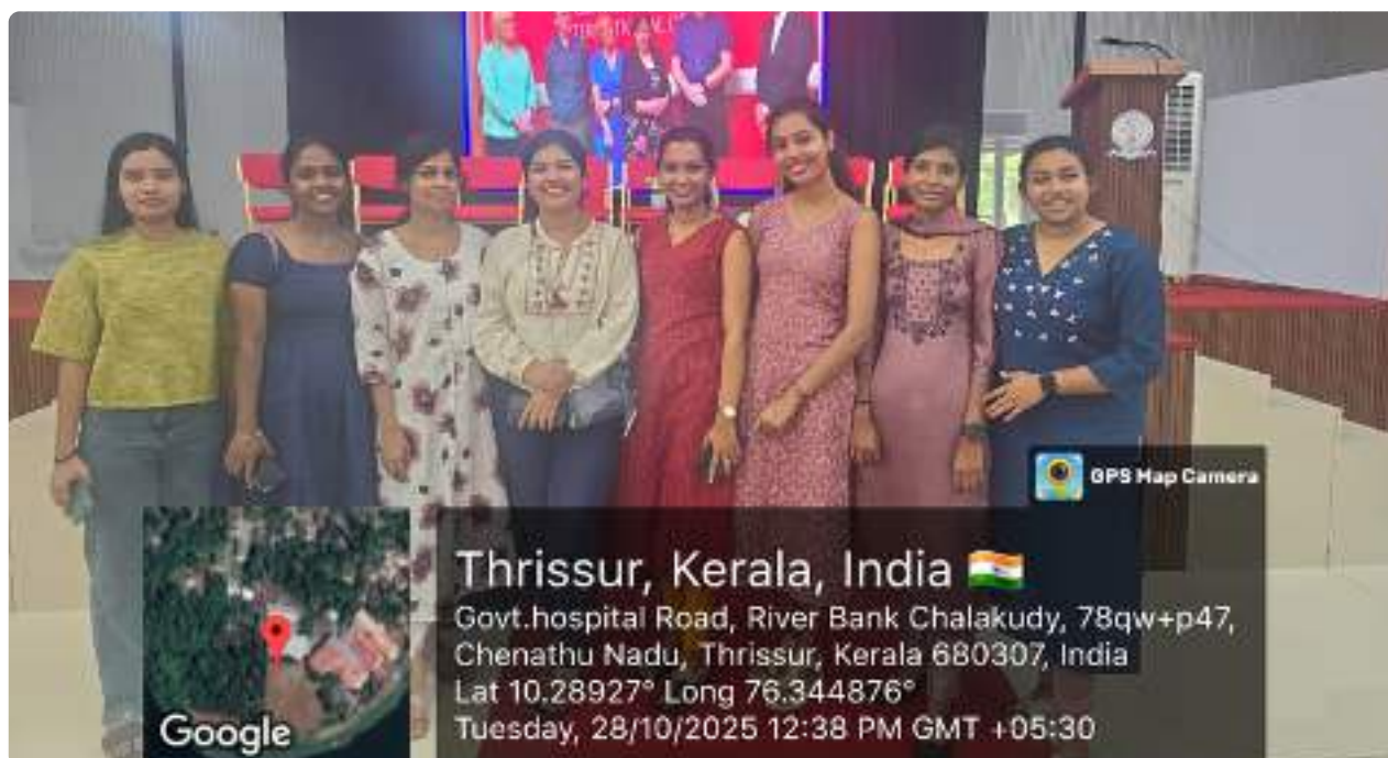
Career guidance Program at St. James College of Pharmaceutical Sciences, Chalakudy on 28-10-2025