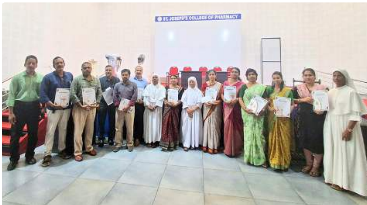
IQAC Academic Luminary Awardees

The Internal Quality Assurance Cell (IQAC) of the institution organised the Academic Luminary Awards ceremony on 13 th November 2025, at the College Auditorium. The event was envisioned to acknowledge and celebrate exemplary contributions by faculty and staff members across multiple domains of academic and institutional excellence. This year, the awards were distributed for both 2024 and 2025. The purpose of these awards was to motivate, recognize, and reinforce a culture of academic distinction, scholarly productivity, and professional dedication among the teaching and non-teaching staff.