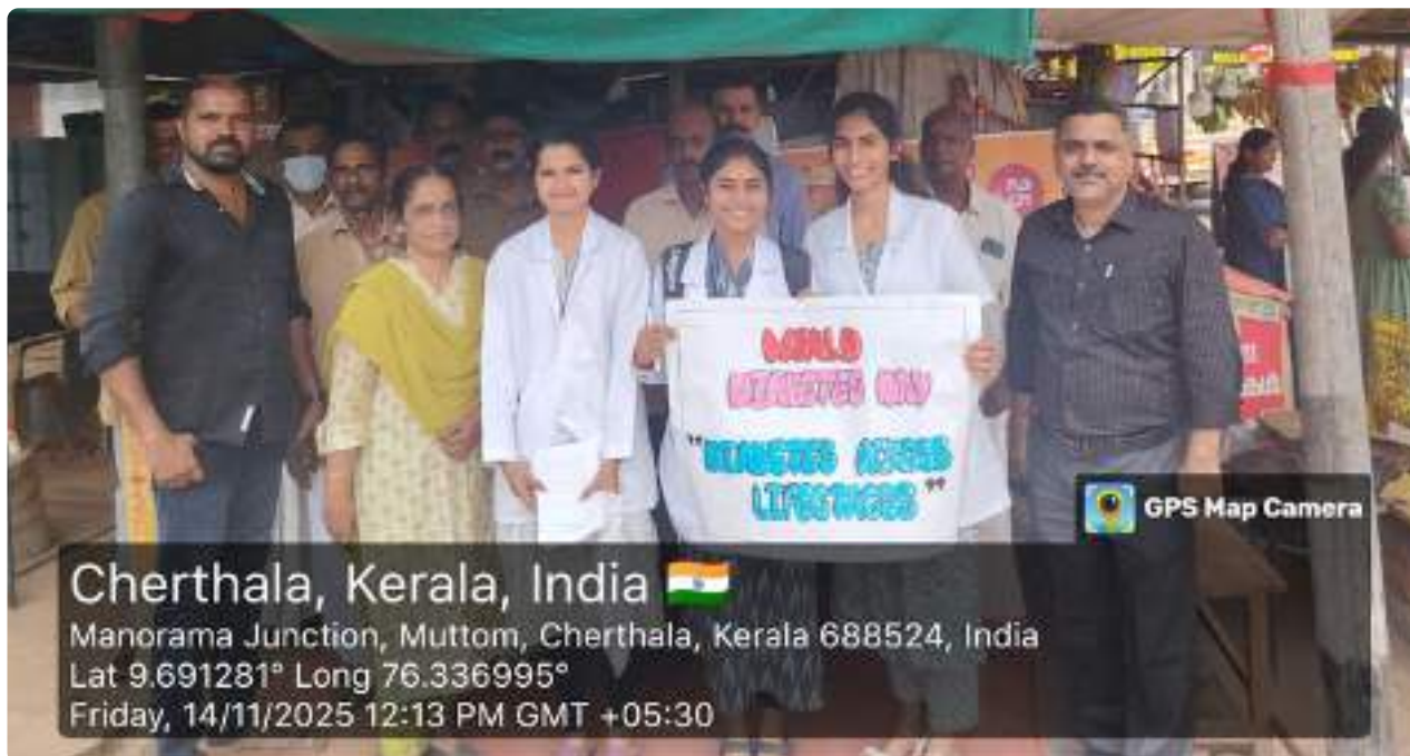
World Diabetes Day Awareness Program