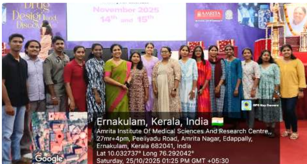
Drug design and discovery conference at Amrita School of Pharmacy, Kochi on 25-10-2025